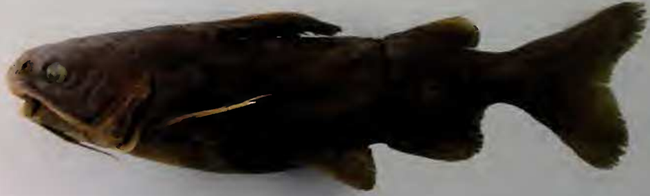
Fig. 1. Galeichthys ater Castelnau, neotype, 190 mm SL, male, SAIAB 63803.

To preserve nomenclatural stability, a neotype is selected for G. ater , since no known types exist. Castelnau (1861) described G. ater from two specimens collected from Table Bay (Cape Town, South Africa) wherein, although it is less frequent than G. feliceps , he erroneously attributed it as 'very rare.' The species is comparatively abundant in the locality where the neotype was collected. The condition of the neotype is very good; the belly is slit longitudinally.